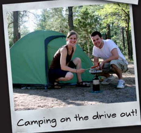
Camping on the drive out!