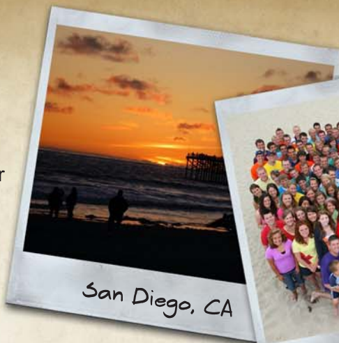
San Diego, CA