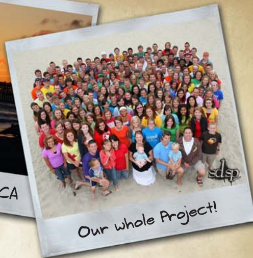
Our whole Project!