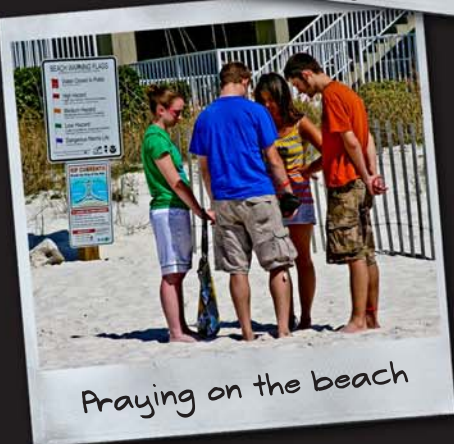
Praying on the beach

The darkness and sin that we see magnified during spring break week reminds us of the battle for souls that is constantly raging around us on campus-- please persist in prayer for students!