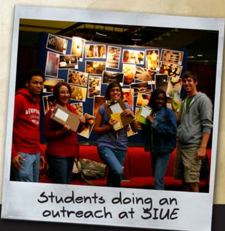
Students doing an outreach at SIUE