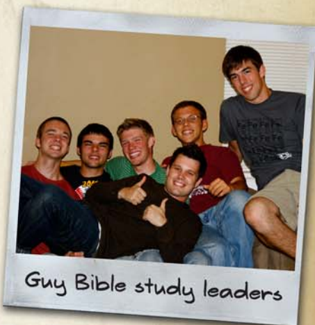
Guy Bible study leaders