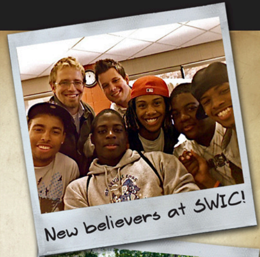
New believers at SWIC!

Through these guys, the Lord has planted the potential for an instant small group Bible study! Pray that these men would grow in their knowledge of Jesus!