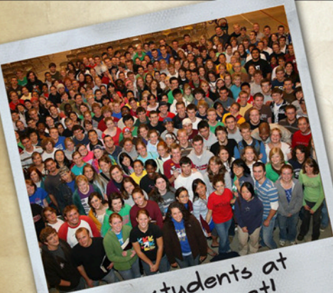
400 students at Fall Retreat!